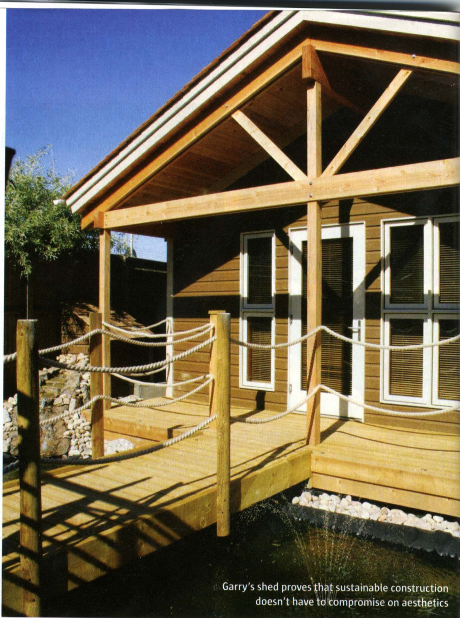
Garry's shed proves that sustainable construction doesn't have to compromise on aesthetics